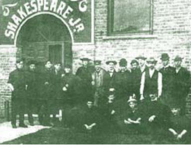
For much of the American Sportfishing Association's history, the industry was dominated by family businesses often passed on through the generations.

Fishing blends so many things we value—far beyond the prosperity of our businesses or the economic strength of our nation. It's what gives us a chance to reflect, refocus, and rejuvenate in our outdoor sanctuaries. It's the lesson plan for helping our children discover the wonders of nature. It's our go-to source of fun during our off-time with family and friends. It's at the heart of our most meaningful experiences because it's what returns our attention to what matters most.