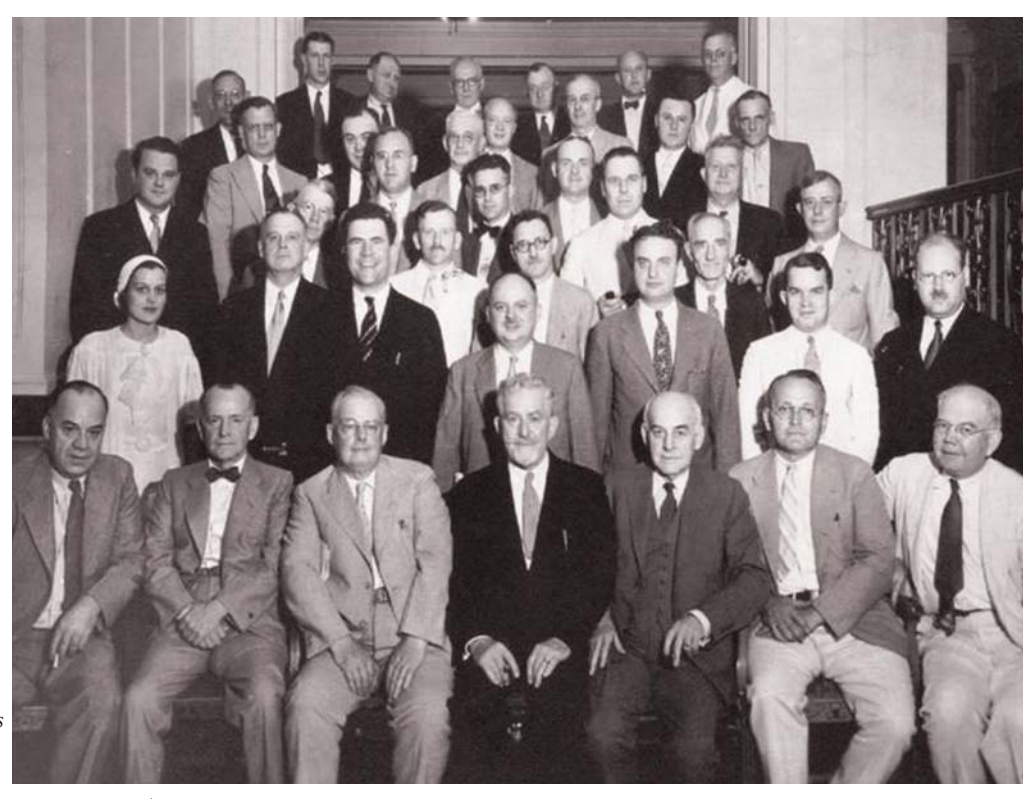
The group that founded the American Sportfishing Association's original organization on June 30, 1933, in Washington, D.C.