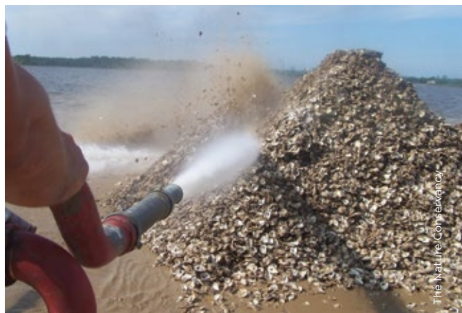
The Nature Conservancy

Recreational fishing is founded on conservation, sustainability and opportunity. Saltwater anglers and the recreational fishing industry they support are critical to conservation and a healthy economic environment for all Americans.