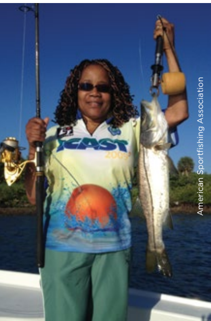
American Sportfishing Association

Without recreational fishing, fisheries conservation would virtually cease to exist. Through federal excise taxes on fishing equipment and motorboat fuel, fishing license fees and direct donations, anglers contribute nearly $1.5 billion annually to fund fisheries conservation and habitat restoration. These contributions drive the most successful conservation and fisheries restoration program in the world.