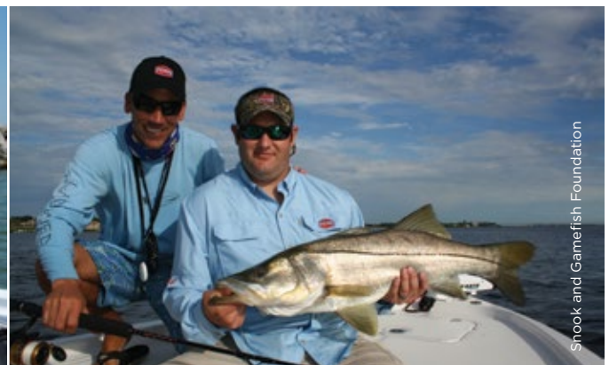
Snook and Gamefish Foundation

Marine fish such as red drum and snook are very successfully managed by state fisheries agencies.